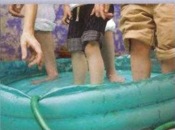
Never submerge a hose.

When water flows backward through the water supply system, it is called backsiphonage or backflow. When that water is accidentally mixed with hazardous chemicals or bacteria, it is called dangerous!